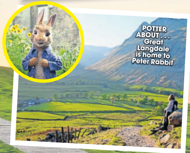
POTTER ABOUT ... Great Langdale is home to Peter Rabbit