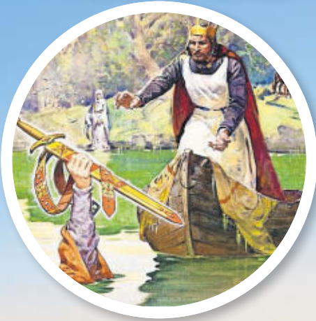
MYSTICAL ATTRACTION ... Glastonbury Tor at sunrise and, inset , depiction of Arthur receiving Excalibur from the Lady of the Lake, with Avalon in background